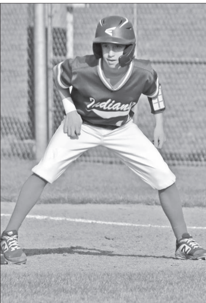
Towns County baseball was successful on 61 of 67 stolen base attempts during the season for a percentage of .910.